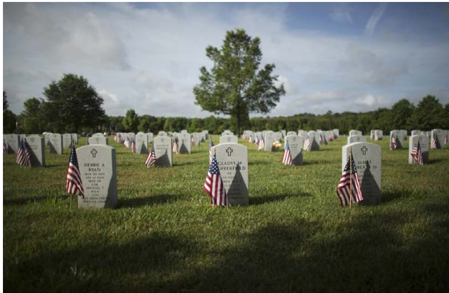
Albert G. Horton Jr. Memorial Veterans Cemetery in Suffolk, Virginia